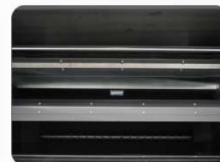
Powder auto-recycling device