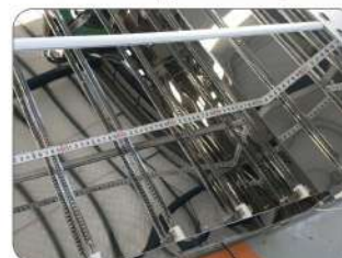
Heating area up to 77cm