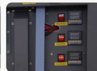
3-stage heating zones