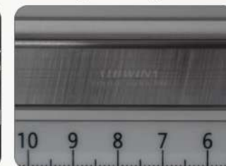
Imported HIWIN guide